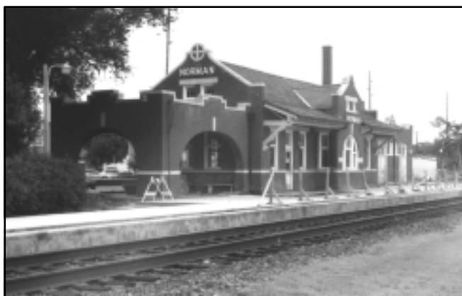
—Ross B. Capon