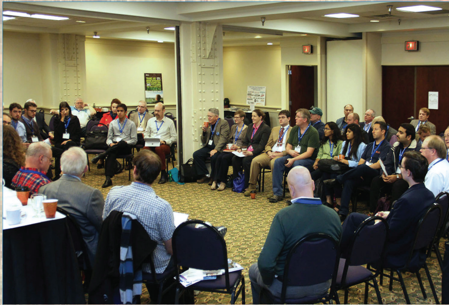
Millennials work on building the next generation of public transportation, including rail.

They were asked to comment on how railroads should adapt to the 21st century, how service could be made more attractive, how much of a tradeoff individuals would like to make between home life and work life, and finally, the policy implications then