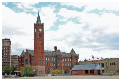
The historic train station in Indianapolis.