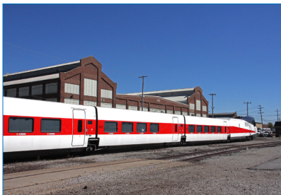
The Talgo train set that was supposed to be operated by the state of Wisconsin.