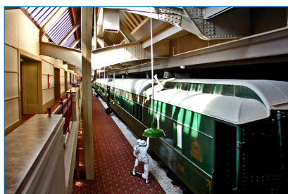
The hotel's rail car rooms.