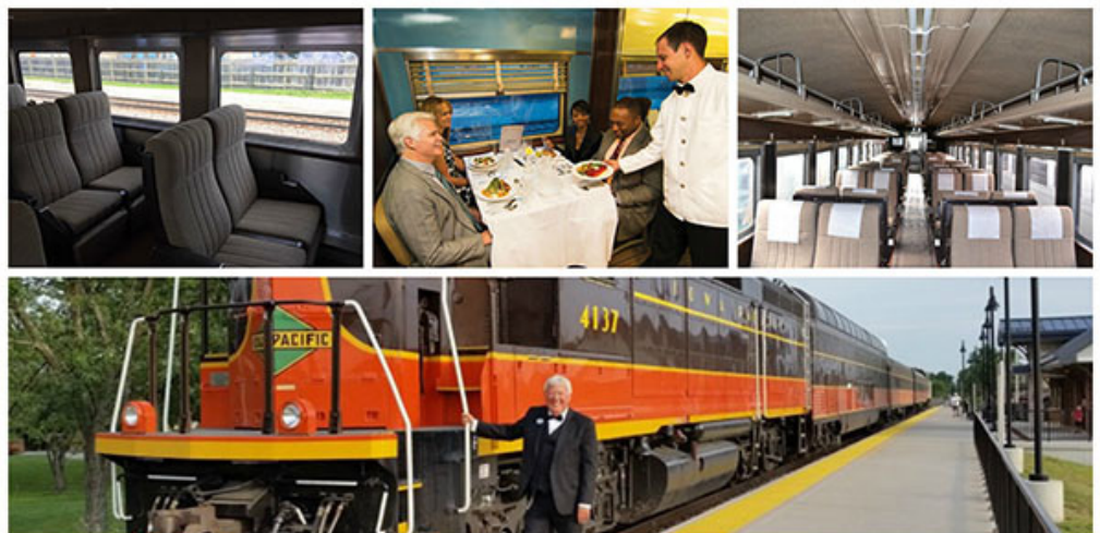
Images of the Hoosier State train.