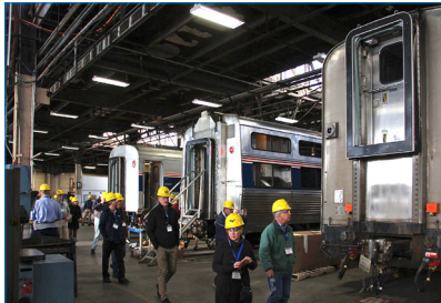
NARP members take a tour of Amtrak's Beech Grove facility.